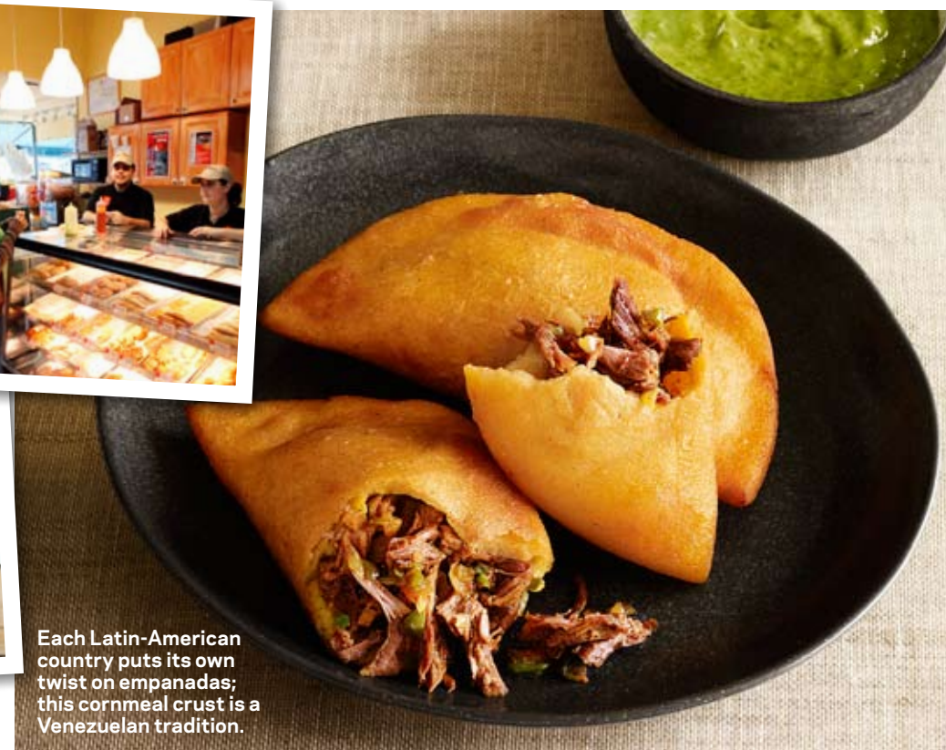
Each Latin-American country puts its own twist on empanadas; this cornmeal crust is a Venezuelan tradition.